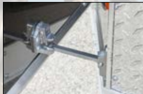
Cast Aluminum Door Hold Backs