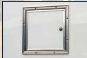
Locking Fuel Doors on Road Side (2)