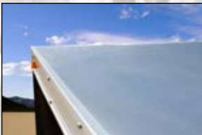
"Double L-Lock" Aluminum Roof Design (Screwless and Seamless)

* Available in 10,000# GVWR. ** Available in 12,000# GVWR.