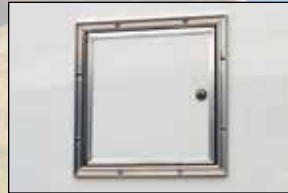
Locking Fuel Doors on Road Side (2)