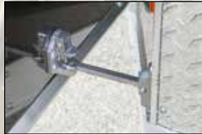
Cast Aluminum Door Hold Backs