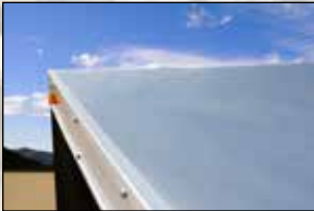
"Double L-Lock" Aluminum Roof Design (Screwless and Seamless)

*Available in 10,000# GVWR. ** Available in 12,000# GVWR.